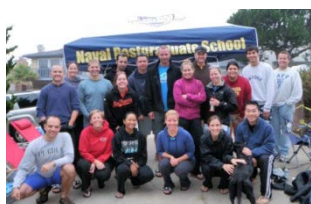
The Hangover Tri Crew

The weather in Pebble Beach was as cooperative as always; thick fog and light rain along the 30 mile ride. The Monterey micro-