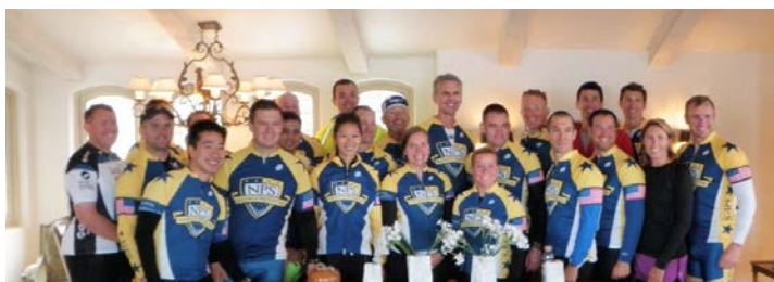
The club enjoys its time with hosts