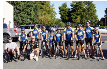
NPS cyclists show their support before heading out on the 30 miler

As part of the club’s continuing efforts to support charitable organizations, the club sponsored 10 NPS cyclists to ride the Mt. Diablo challenge on September 3rd in Concord, CA. This ride was in support of the Sentinels of