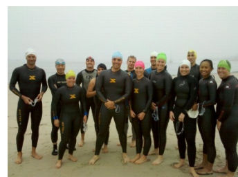
The early morning swimmers before the start of the Hangover Tri