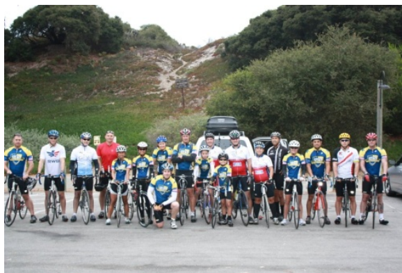
Memorial riders getting ready to launch

Over 20 NPS cyclists and supporters rallied in the parking lot across from the Del Monte gate bright and early on the morning of